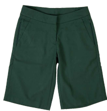
FORMAL GREEN SHORT