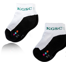
KGSC ANKLE SOCKS