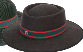
FORMAL WOOL FELT HAT