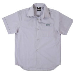
FORMAL SHIRT (TIE)