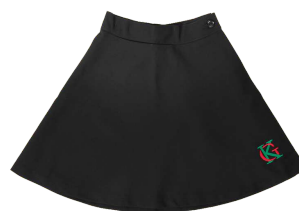
BLACK WRAP SKIRT - COTTON