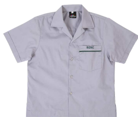
CASUAL MIDDLE SHIRT