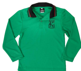
GREEN LONG SLEEVE POLO