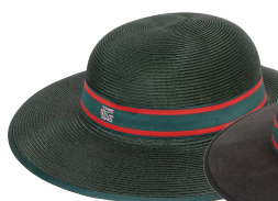
FORMAL POLYBRAID HAT