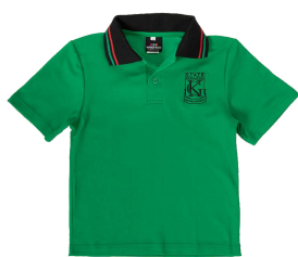
GREEN POLO - POLY/COTTON