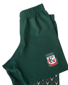
SUBLIMATED SPORTS SHORTS