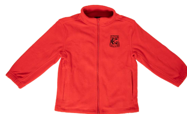
RED POLAR FLEECE