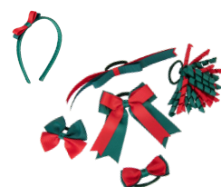
ASSORTED HAIR ACCESSORIES