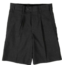
FORMAL GREY SHORT