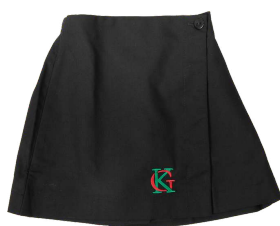
BLACK SKIRT - COTTON