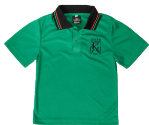
GREEN POLO - POLYESTER