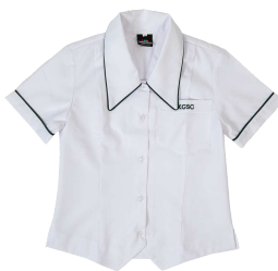
FORMAL BLOUSE (TIE)